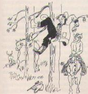
"All I said was, you can shoot off of any horse... at least once."

But for now, the Kuglers are enjoying their horses and continue to promote them.