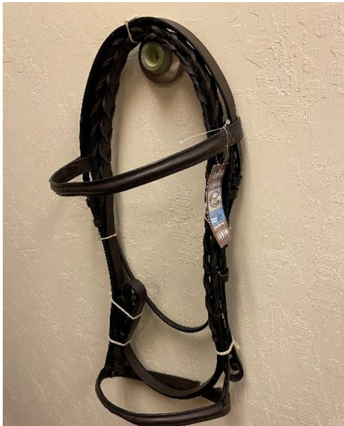
English Bridle Giveaway

She was very excited when we contacted her saying, "I've never won anything!". Her name was picked out of a hat filled with all the eligible members of the ABCR by an unaffiliated person. We hope to continue this contest through 2023, make sure you get your membership current so you can be included for the draw in 2024!