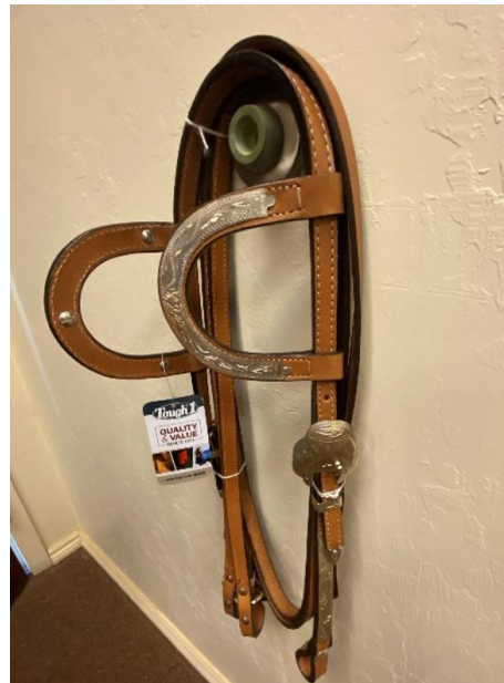
Western Bridle Giveaway