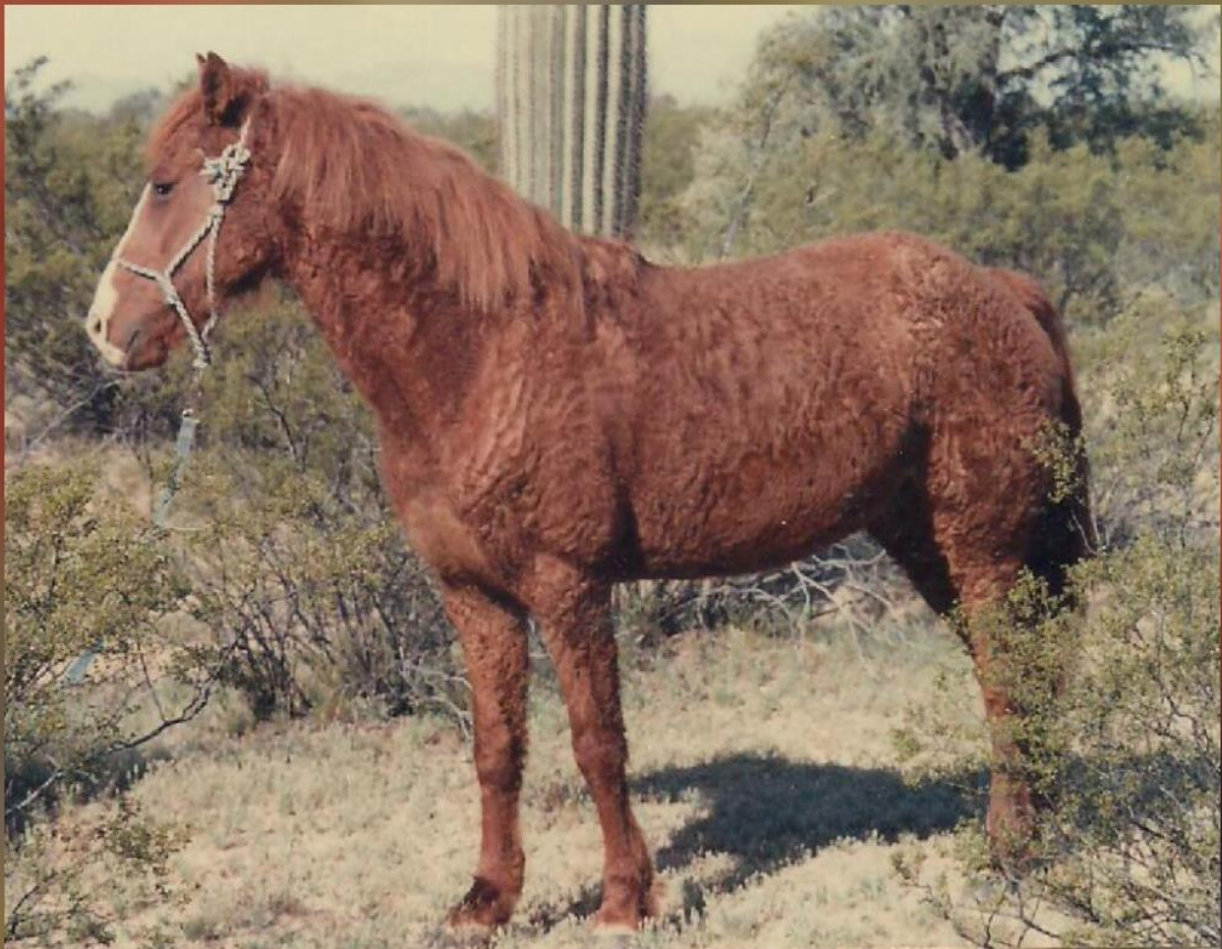
ABC 79 B.C's September Sue

The ABCR Breed Standard describes an American Bashkir Curly as being on average 14 to 16 hands and weighing 800 to 1250 lbs. The head is of medium size with a well-defined jaw and throat latch. The eyes are wide set with eyelashes that curl up. Ears are short to medium in length with curls inside. The neck is of medium length and deep at the base where it joins the shoulder. The back is noticeably short and deep through the girth. The legs are heavy boned with short cannon bones as compared to the forearm. They have a curly coat in wintertime and generally display a notable gentle disposition.