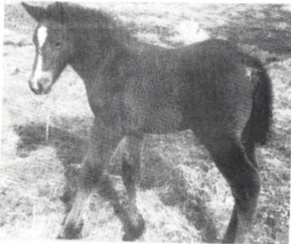
SYNDAR'S CURLY JACKET ABC -1048 --

Does this picture look familiar to you? Enjoy!