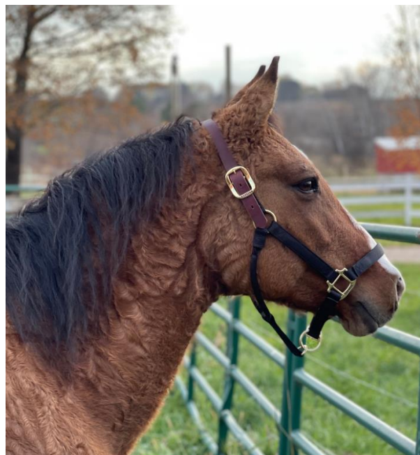
Prince Alder's Yellow Rose aka Izzy ABC 3172