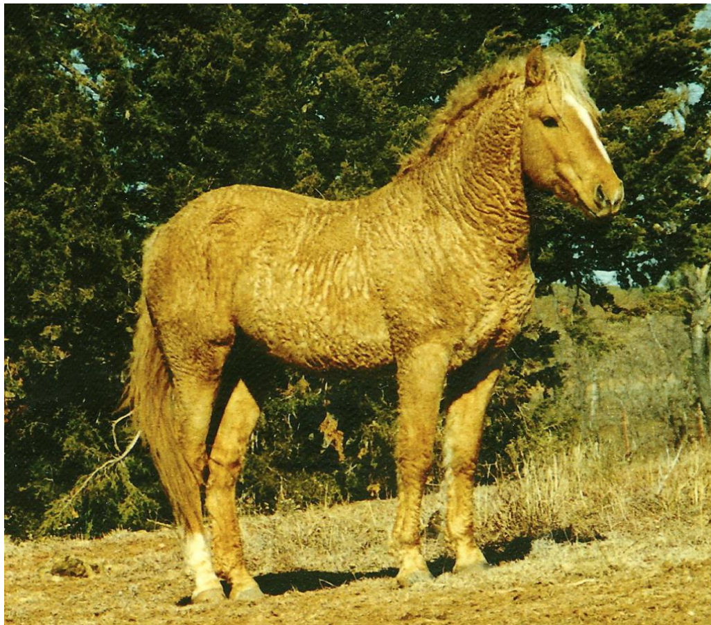
ABC 1432 FOX FARMS CLASSY

Hopefully by next year, we will be able to hold the ABC annual convention in Person in Reno, Nevada. Tentative dates that we are looking at will be the end of June, early July. Please check back on the website or the next Curly Cues for more information.