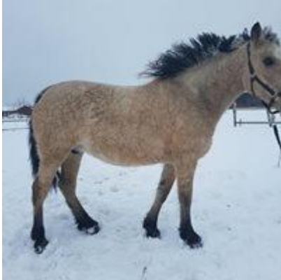
MISSOURI'S FOGGY PRINCESS OWED BY INGER OJA SWEDEN