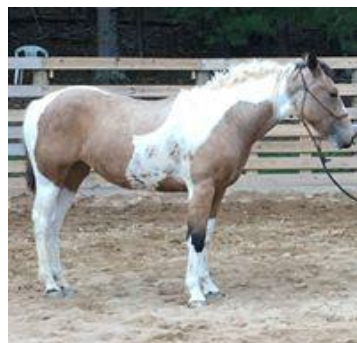
LAKOTA SUE OWNED AND BRED BY TICIA KRIBBS PILOT MOUNTAIN, NORTH CAROLINA