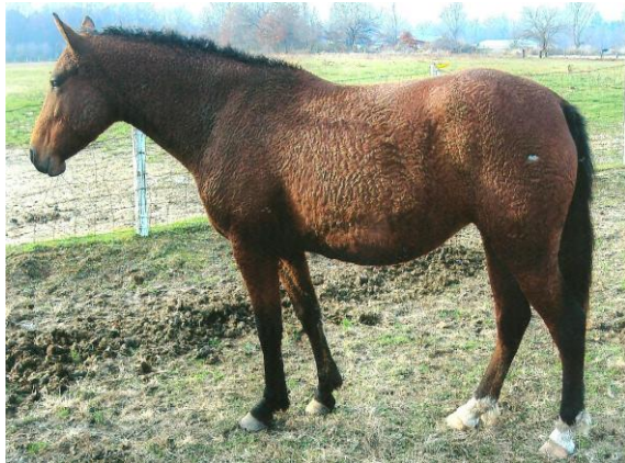
WWW KaCee Alexis 14 H Bay 2011 Mare