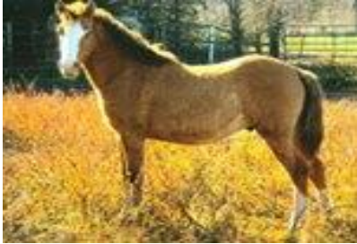
WWW HANDSOME BUCK OWNED AND BRED BY MARV WOODKE MONTEREY, INDIANA