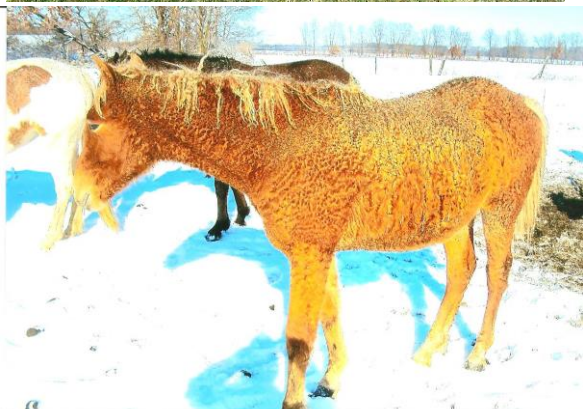
Ruby's Good Boy