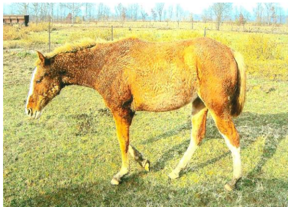
WWW Proud Mary ABC# 4203