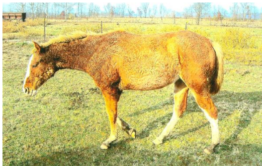
WWW PROUD MARY ABC# 4203