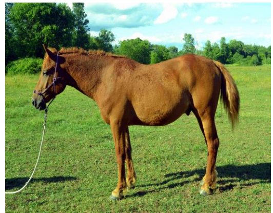
WHIRLWIND GUINNESS ABC# 4202