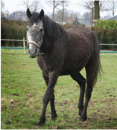
AH MOONLIGHT ABC# 4201

Welcome together with us our latest Full Curly Horses!