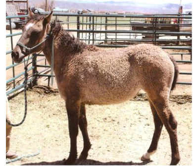
BELL'S SOX ABC# 4200