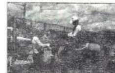
Holly Chase Owner & Rider $500.00