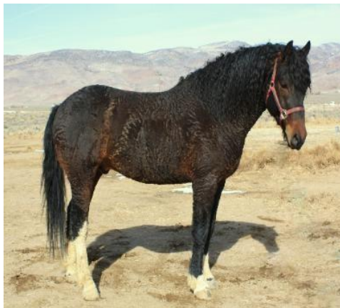
Peter Lakota, ABC# 3686, 16 hand Bay Stallion, Standing at High Desert Equine Center in Reno, Nevada. Sired by Curly Tom, ABC# 1539, a Foundation ABCR Stallion. www.hdequine.com

Send in a pic and little blurb of your horse to be featured in the CC's !