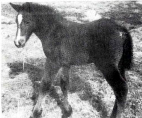
SYNDAR'S CURLY JACKET ABC -1048 --

Does this picture look familiar to you? Enjoy!