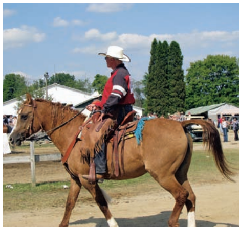
Scenes from the 2012 Crawford County Fair.