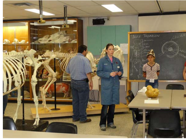
Above and below: University of Guelph Tour