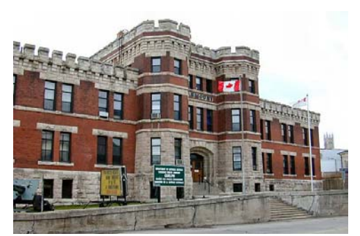
Guelph Armoury, site of the 2010 ABCR Convention

So all's well that ends well. We had a great time, got to visit old friends, meet new friends, do the business we needed to get done, visit new sights and have a great time overall. We hope to see EVERYONE in Vermont next year!