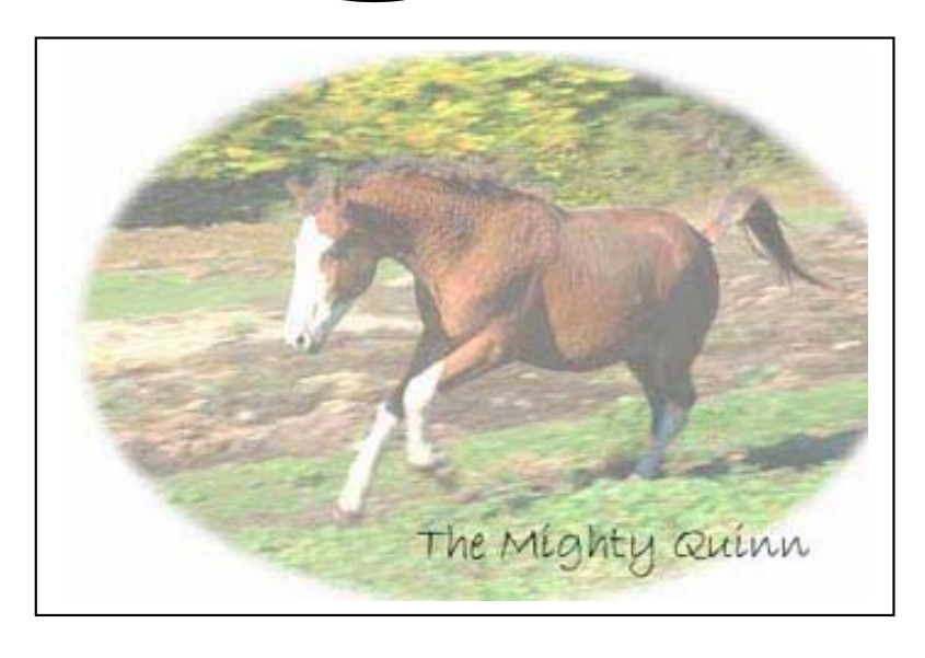
Top O' The Hill Farm ~ Springfield, Vermont July 21-24, 2011

Top O' The Hill Farm is pleased to host the American Bashkir Curly Convention for 2011. This is an exciting event for the New England area. Top O' The Hill Farm is the first New England breeder of the wonderful American Bashkir Curly Horse, and the quintessential Vermont side-hill farm is home to many gorgeous and capable Curly horses. The herd is based on many of the old foundation lines and, like the traditional Vermont Morgan, is a "using" horse, with potential in almost every arena of horse activity. We hope this convention is one of our best to date, and look forward to welcoming members to Vermont!