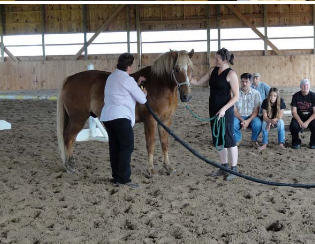
Demonstration of horse washer vacuum