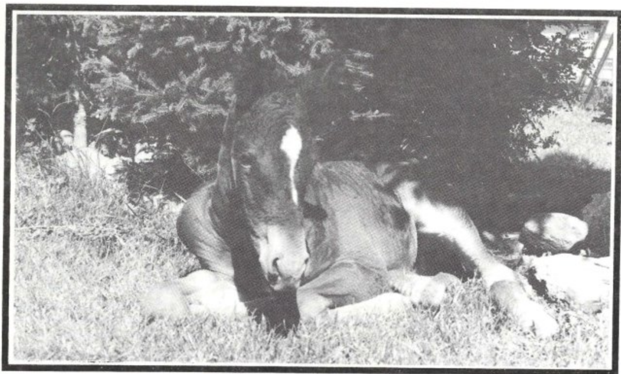
1993 "Foals" Photo Contest Winner