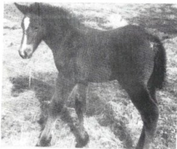
SYNDAR'S CURLY JACKET ABC -1048 --

For those coming to Ely for the first time, you will find a variety of things to do -- golf, tennis, bowling, swimming, boating, water skiing, fishing, garnet hunting, gun and bow ranges, and, of course, 24-hour gambling casinos, plus two museums. You will love Ely's beautiful mountains, clean air, sunshine and cool nights. Remember, the altitude is 6500' so bring a jacket for evenings. Convention reservation sheets, motel lists and horse show entries will be sent out early in May, so watch for them. And -- come help us celebrate our 20th annual convention and 15th horse show -- you'll be glad you did!